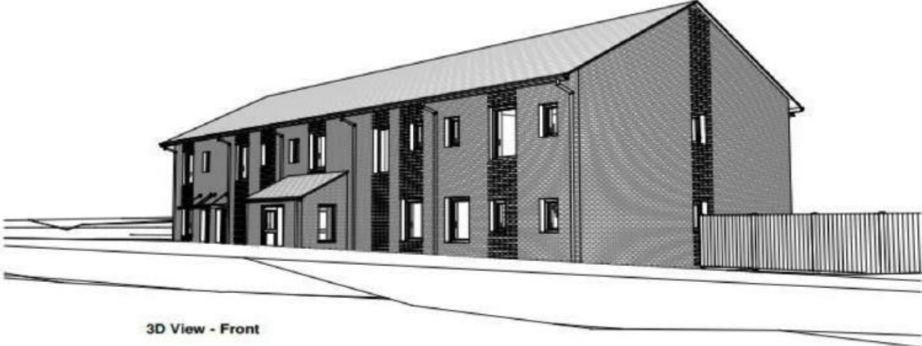
3D View - Front