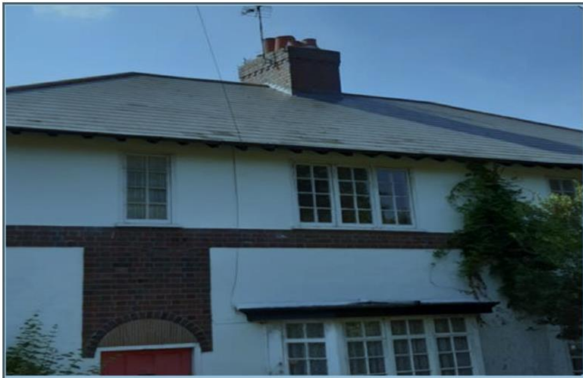
Original Front Elevation