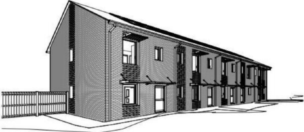
3D View - Rear